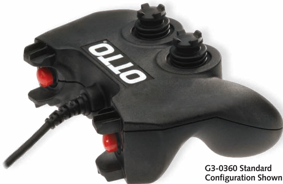
G3-0360 Standard Configuration Shown